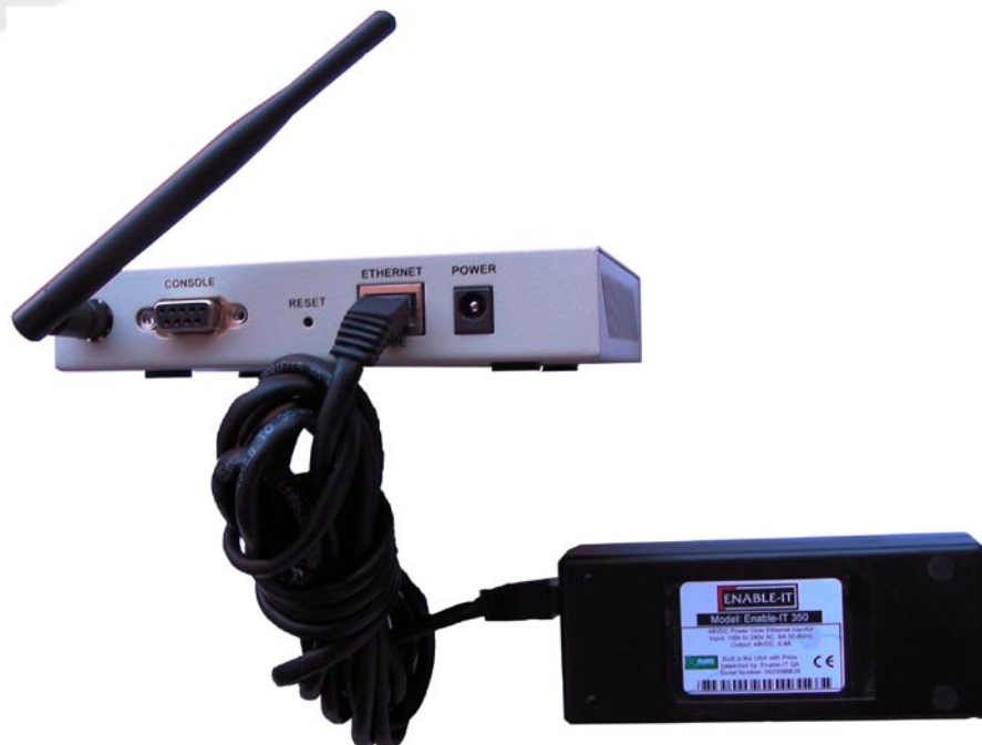
Figure 1 Enable-IT 350 to a 8424 WiFi PoE Access Point